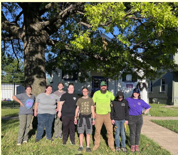
Troop 6 volunteered at Sunfest. The Osage Hills District Committee worked at a recruitment booth at Sunfest. Pack 15 had a booth at Sunfest.