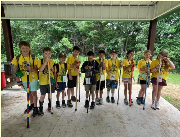
Cub Scouts at this year's Grand Lake Cub Scout Day Camp had a blast with BBs,