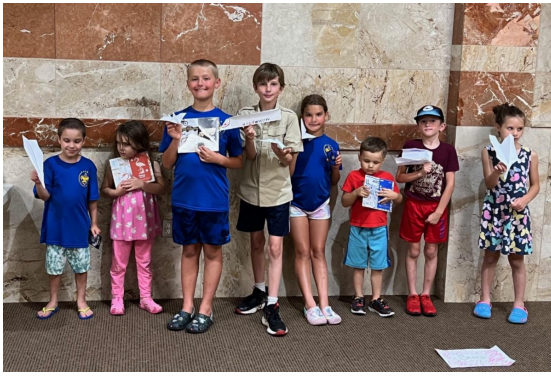
Troop 6 went to Colorado to camp and hike.