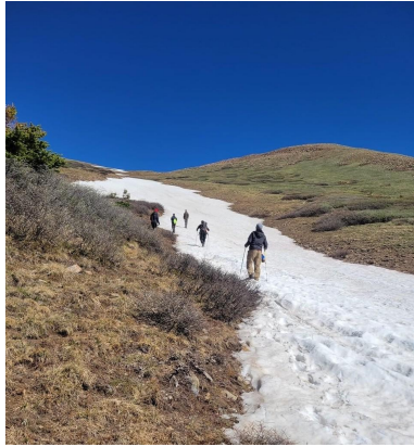
Bartlesville Boys and Girls Club boys came to camp.