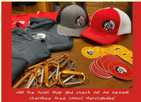
Visit the scout shop and check out our newest Cherokee Area Council Merchandise!